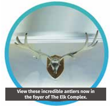
View these incredible antlers now in the foyer of The Elk Complex.